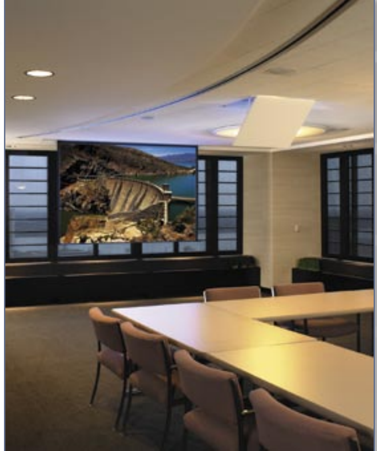
Revelation projector mount and Access Series E projection screen. DTE Energy Executive Dining Room, Detroit, MI. Dealer: City Animation, Troy, MI.