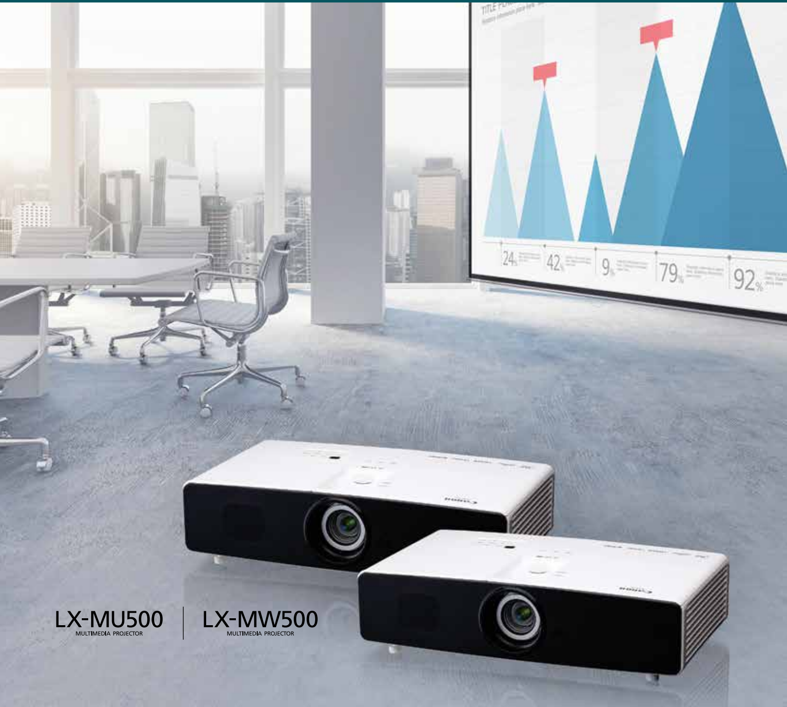
LX-MU500 MULTIMEDIA PROJECTOR